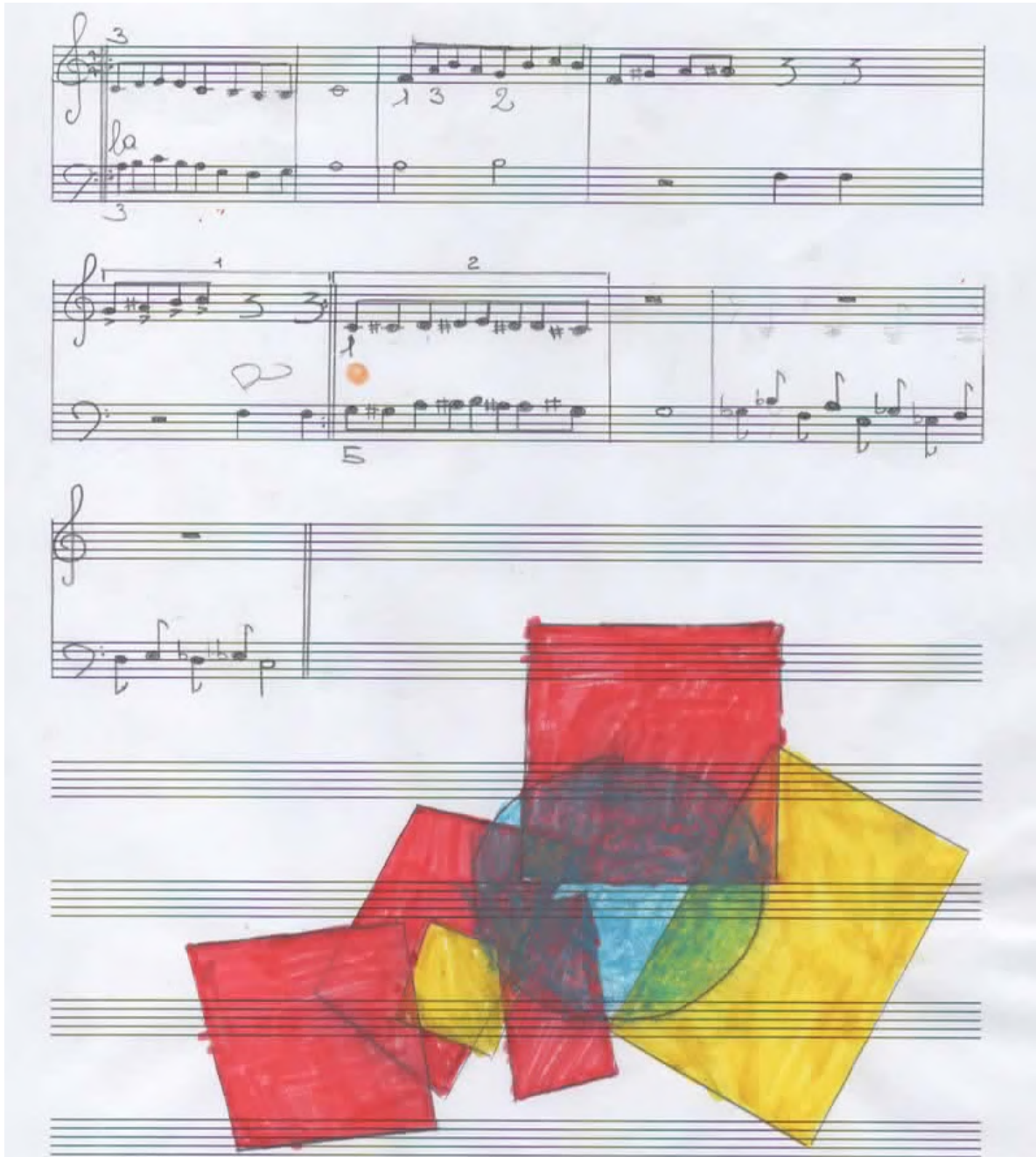
Fig. 6 – Musical Changes

The last piece, Nuvola nera (Black Cloud) was previously written for piano and then 'perfected' and adapted to the toy piano during the workshop (Fig. 7). The composer (pupil 3, not a pair this time) was the pupil who had performed the Duvernoy's piece and the reference to this source of