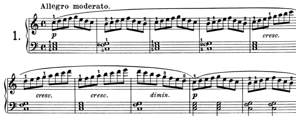
Fig. 2 – Excerpt from Elementary Studies Op. 176 n. 1 , measures 1-10.

Pupils grasped the following basic elements: questions and answers; a voice speaks and the other one is silent (with rests) then replies; a voice speaks loudly and the second one speaks softer. The third piece (Fig. 2) was a study by J.B. Duvernoy (1903, p. 3). Here pupils observed how long chords accompany waves of notes above.