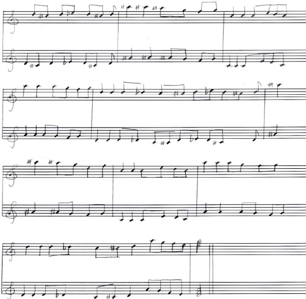
Fig. 5 – Nocte stellata (Starry Night).

While the young composers (pupils 7-8) were writing the fourth piece, Musical changes (Fig. 6), and facing the difficulty of putting together different ideas/materials, Zavala suggested to place the ideas side by side. This compositional thinking suited the title of the work and the composer pupils said they took the title from the assembly procedure adopted “because there is no logical thread, but continuous changes”. Here the pupils’ compositional approach raises some key points. In the first bar only one beam connects the first eight notes, instead of two or four beams. This indicates phrasing, and it is a practise often used nowadays to show more clearly musical ideas that music writing software programs usually standardise. Thanks to handwriting, pupils instinctively beamed