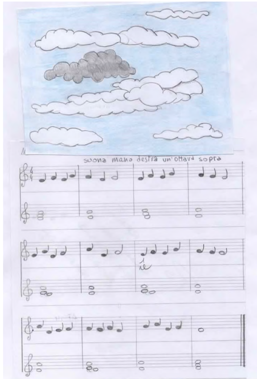
Fig. 7 – Nuvola nera (Black Cloud).

As a last activity, an improvisation session, named a Crazy Improvisation , gathered all participants together in the music room of Villa Bernasconi Museum, where we moved to on the second day. Once the rehearsal started, Zavala suggested the pupils use very simple elements, such as: small patterns of sounds that may comprise two notes and changing octaves; rhythmic patterns played