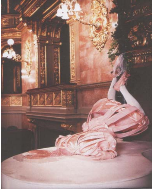
Figure 21. Apart from adornment and costumes ascending and descending are devices used extensively by shamans and Performance Artists for entirely different reasons to those of Matthew Barney. Barney also has the best technology available to create these effects for his global audience, whereas shamans rely entirely on the imagination of their communities. Matthew Barney (1997) Cremaster 5. Video still, Budapest.

artists' disadvantages, as they have to re-create a community of some kind (see figure 21). Barney uses film, which separates him completely from the community. Cohen goes into places where he marks with the greatest emphasis the fact of his not belonging to the community (see figure 22). Abramović uses viewers dedicated to her performances as the community she engages with (see figure 23). None of the communities of the artists is their own. Abramović for years had no fixed abode. The communities created by the artists are made to serve a purpose which is different from that of the shaman's community.