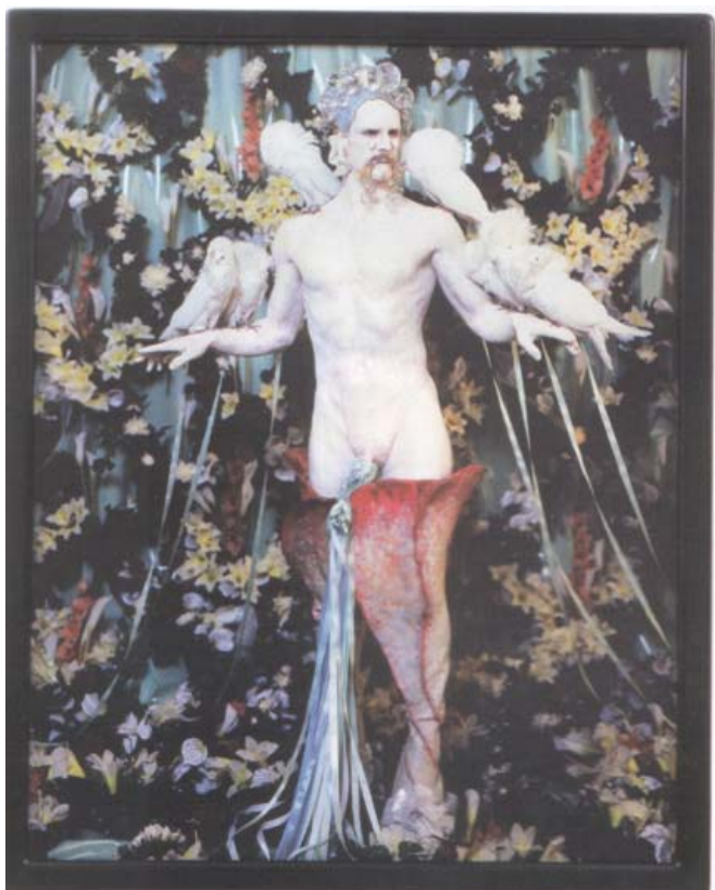
Figure 13. Invoking Shamanic devices: Presenting a persona, animal familiars, flight and mythology. Matthew Barney, Cremaster 5 (1997) Video still (Illustration Spector, N. 2002, Unpaginated).

kinds of performances. For shamans this may take the form of animism, a guardian spirit, or alternate experiential reality, which in the case of a Performance artist may be described as their alter ego. For the Performance artists, multiple personae enable them to reflect for their viewers innumerable states of mind, imagination, feeling, desire. The dressing up and changes of personae are often dazzling and fascinating. For the audience they give an opportunity to reflect on our contemporary lebenswelt . The shaman does not always expect exactly the same from his/her audience, but the adoption of changing personae and the use of a range of props is an important feature of shamanic performances.