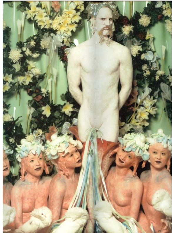
Figure 16. Spirit allies and communication with animals are part of traditional shamanic practice. Matthew Barney, Cremaster 5 Water Sprites (1997) Video still. (illustration Spector, N. 2002, Unpaginated).