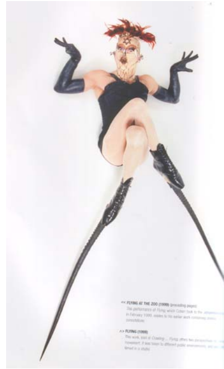
Figure 12. Shamanic intervention and mediation (Animal/Human rights) Steven Cohen - Flying at the zoo (1999) Performance still. (Illustration: De Waal, S. and Sassen, R., 2003 p. 54).

The purposeful use of hybridised, transformed, adorned and masked or naked bodies of the Performance artists is a way of marking strangeness, as there is no guarantee that in a completely secular viewing public there is a commonly shared idea about what would be strange/other. By making their bodies, as the cultural theorist, Michel Foucault says, an “inscribed surface of events”, rich in possible disruptions to the hegemonic minority reflecting the gender and class boundaries of contemporary culture, they can be sure to target as wide a section of viewers as possible for their activism. 10