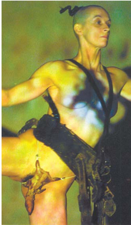
Figure 5. Shamanic intervention addressing gender marginalization, Steven Cohen and Regine Chopinot – I wouldn't be seen dead in that , Dance Umbrella festival, South Africa (2003). Performance Still (Illustration: De Waal, S. and Sassen, R., 2003, p. 75).