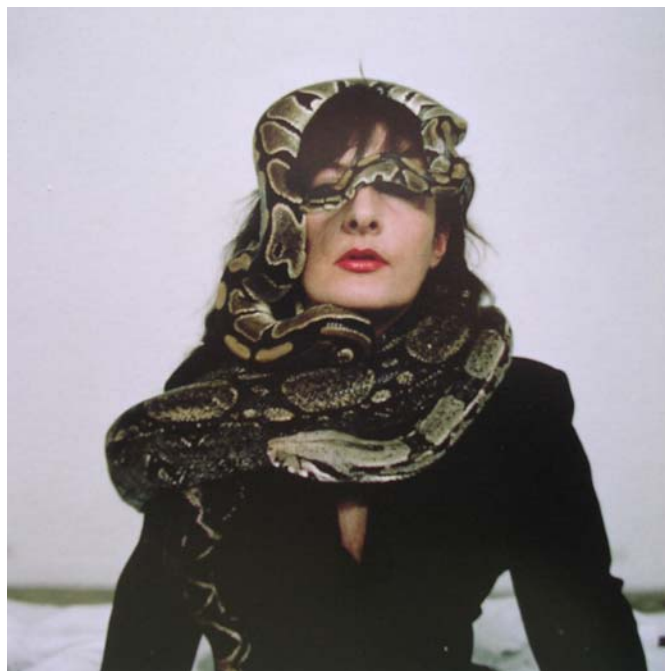
Figure 2. The Yugoslavian Performance Artist Marina Abramovic, Dragon heads , Glasgow, (1990). Performance still, (illustration: Abramovic, M. 1998, p. 327). According to the researchers Winkelman and Krippner, dealing with challenges to one's survival stimulates bio-cognitive potentials and adaptations.

The artworks of three Performance artists will be analysed under the headings of Adornment, Props and Othering, Identity and Persona, Desensitization, Ritual and Liminal States (see figure 2).