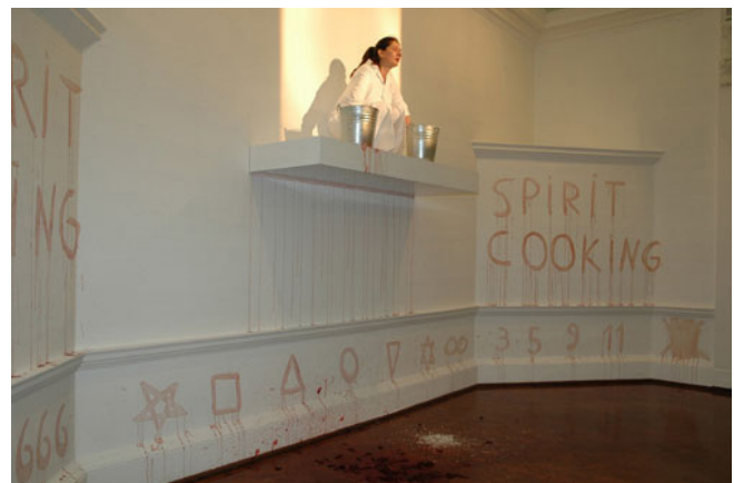
Figure 23 a & b. Site specific reconciliation, Marina Abramović (2005) Spirit Cooking Johannesburg Art Museum. Photograph by Abrie Fourie, Arthro 2005. (Accessed on 29/11/2006).