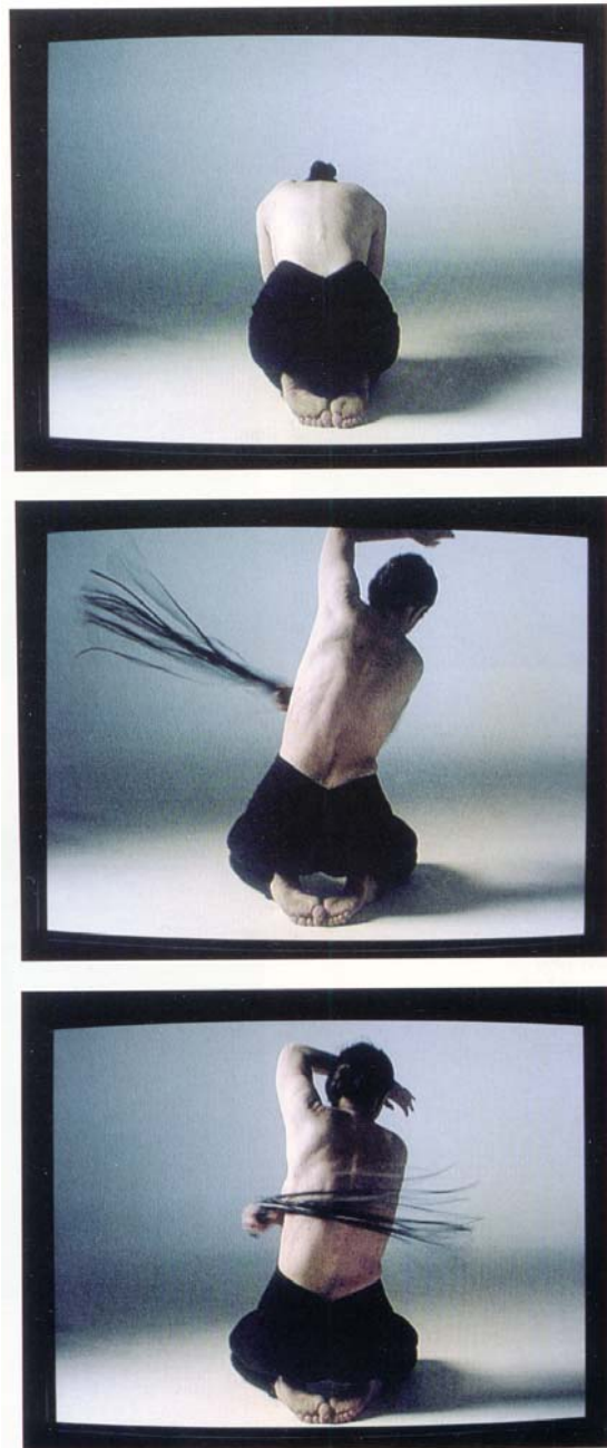
Figure 18. Pain as a source of information. Marina Abramovic, Spirit House (1997). Performance still (Illustration: Abramovic M., 1998, p. 385).

Isaac Marks the author of Fears Phobias and Rituals says therapeutic exposure is an accepted treatment for anxiety as it brings about de-sensitisation and a form of stress immunisation . 11 It has been shown that self-exposure to fear cues and painful situations are almost as helpful as therapist-aided exposure. If this is true, the artists might be said to be acting out a version of what we believe is a ‘stress immunisation’, on the larger scale than ordinary people can usually do (see figure 19).