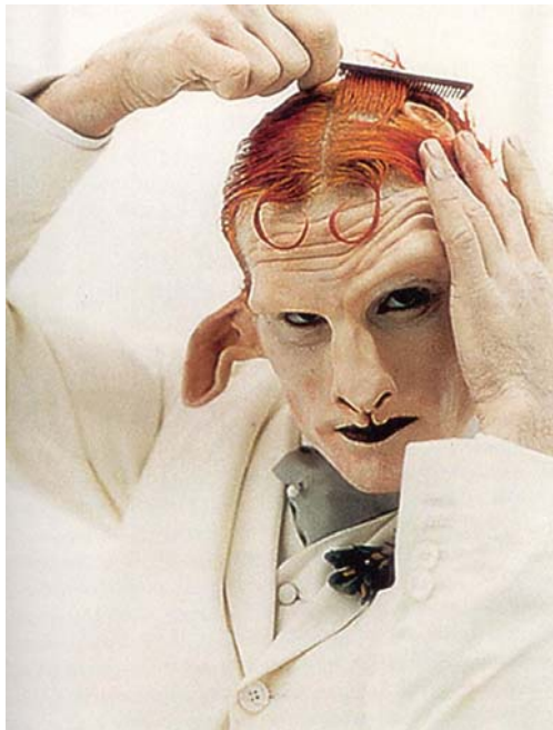
Figure 3. The American Performance Artist Matthew Barney. The Loughton candidate in Cremaster 4 , (1994) Video still. (Illustration Spector, 2000, p. 59).

The selected artists act out in ways which are, dramatic, shocking, extreme and haunting, reflecting the struggle of the many people in contemporary Western society who feel marginalized. Therapeutic shamanic psychosocial practices, which nonetheless belong to a profoundly different worldview than that which the three performers hold, are striking in their performances (see figures 3-6).