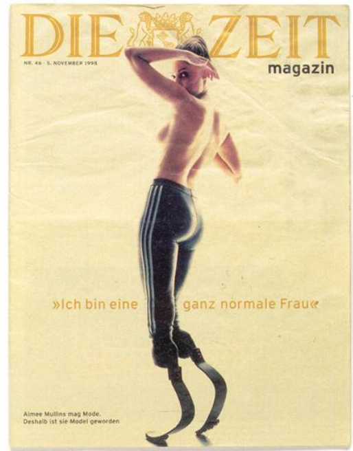
Figure 9a & b. Aimee Mullins in Cremaster 3 by Matthew Barney (2002), invokes shamanic intervention mediation and activates shared healing, myth and the placebo effect. (Illustration Spector, 2000, unpaginated).