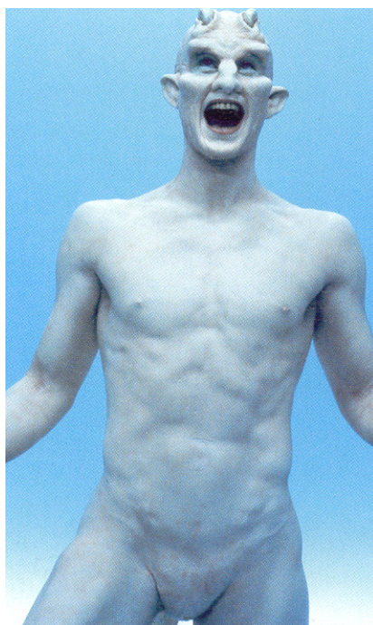
Figure 1. Mathew Barney, Drawing restraint (1993). Video still (Illustration: Spector, N. 2002, p. 22).

The artworks of three Performance artists will be analysed under the headings of Adornment, Props and Othering, Identity and Persona, Desensitization, Ritual and Liminal States (see figure 2).