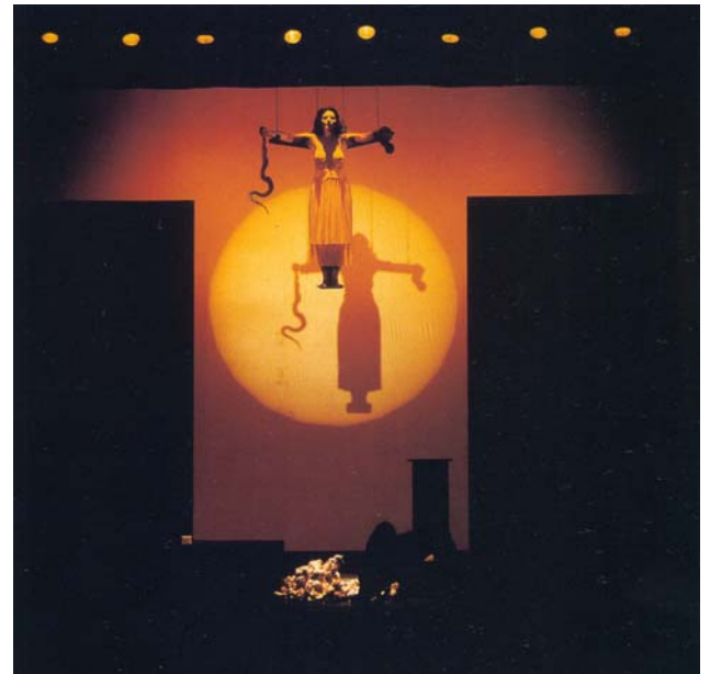
Figure 10. Marina Abramovic, Biography , Vienna & Antwerp (1992). Performance still.