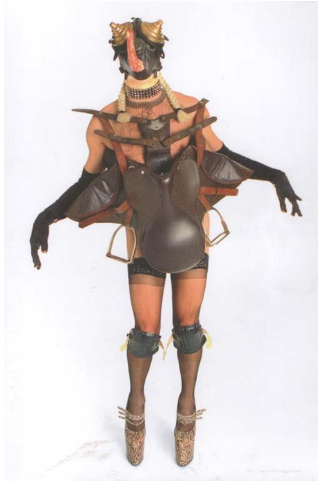
Figure 17. Animal totems and animal metaphors and journeys to lower and higher realms of existence are central to shamanic practice. Steven Cohen, Fashion Mule (1998). Performance Art, Greyville Race Course, Durban, South Africa (De Waal, A. & Sassen, R., 2003, cover page).