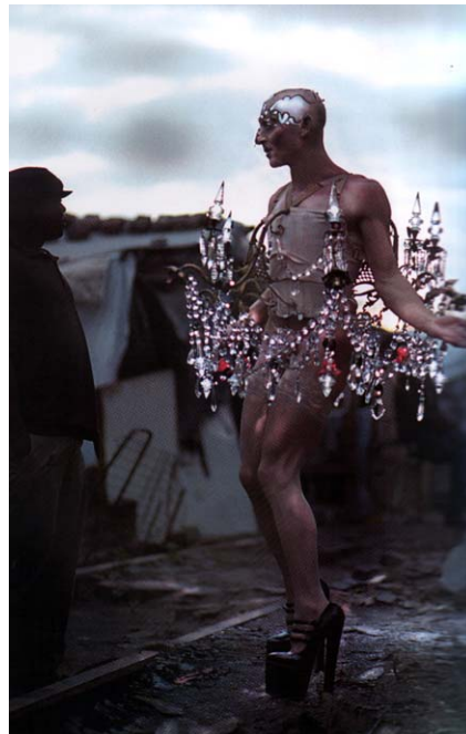
Figure 4. The South African Performance artist Steven Cohen, Chandelier (2002). Performance still. Steven overcame near-fatal illness in an isolation ward before becoming a Performance Artist specializing in mediation and socio-political commentary). Overcoming serious illness is often a pre-requisite for becoming a shamanic healer. (Illustration: De Waal, S. and Sassen, R., 2003, p. 70).