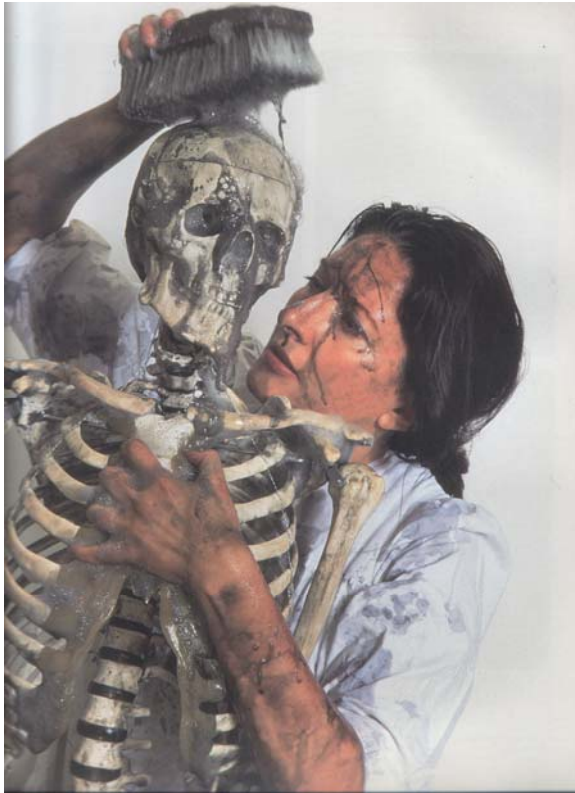
Figure 15. Marina Abramovic, Cleaning the mirror, 1&11 (1995). Performance and video stills. Abramovic applies shamanic techniques such as Othering, cognitive reversal through her own agency, a subjective experience, soul flight and vision quests (Illustration Abramovic 1998, p. 243).