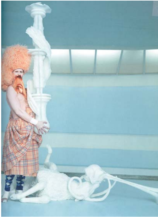
Figure 11. Shamanic, Symbolic manipulation of the scapegoat. Matthew Barney, Cremaster 3 (2002). Video still, (illustration Spector, 2000, unpaginated).