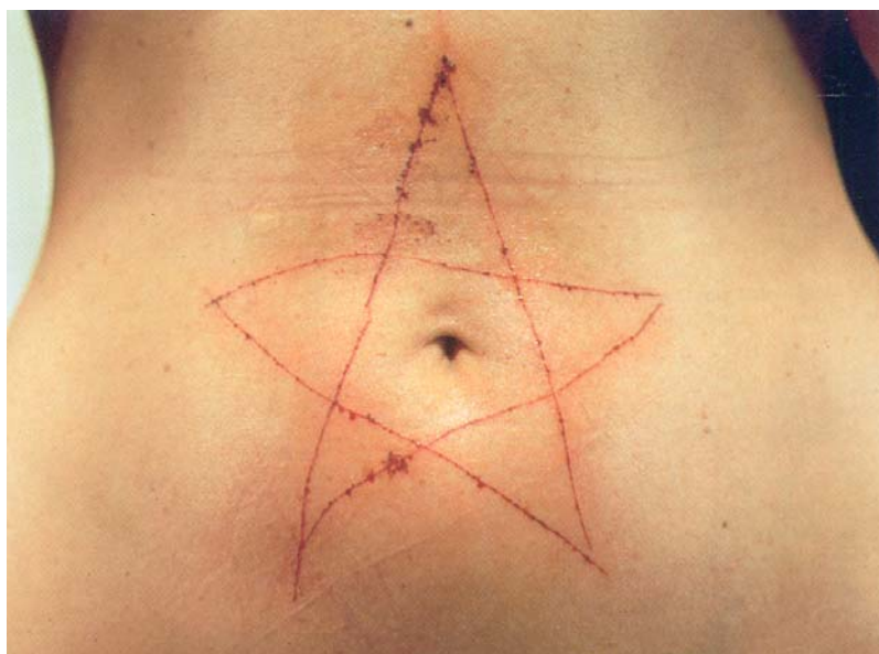
Figure 20. Marina Abramović, Lips of Thomas (detail) (1975) and repeated in The Biography (1992). Performance Art, Hebbel Theatre, Berlin, Germany (illustration: Abramović, M., 1998, p. 394).