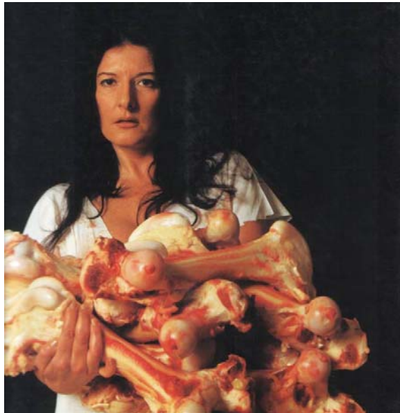
Figure 7. Socio-political awareness, facilitated by ritual. The symbolic component of ritual attempts to facilitate change. Marina Abramovic, Cleaning the house (1995). Performance still. New York (Illustration: Abramovic, M, 1998, p.365).

the self. 8 Performance artists and shamans understand how dominant social structures and social effects interact. Visual thinking and mimetic skills are fundamental to shamanic and Performance art practice and facilitate processes to heighten their conscious awareness. Winkelman has found scientific proof that heightened states of consciousness affect the paleomammalian brain to induce the everyday integration of information. Activities such as the Performance art under discussion are able to heighten the state of consciousness and produce limbic-cortical integration, inter-hemispheric synchronization and neuro-phenomenological relations. 9 It activates areas in the brain implicit in understanding socio-emotional dynamics, repressed memories, unresolved conflicts, intuitions and self-conscious awareness. This supports the hermeneutic theory.