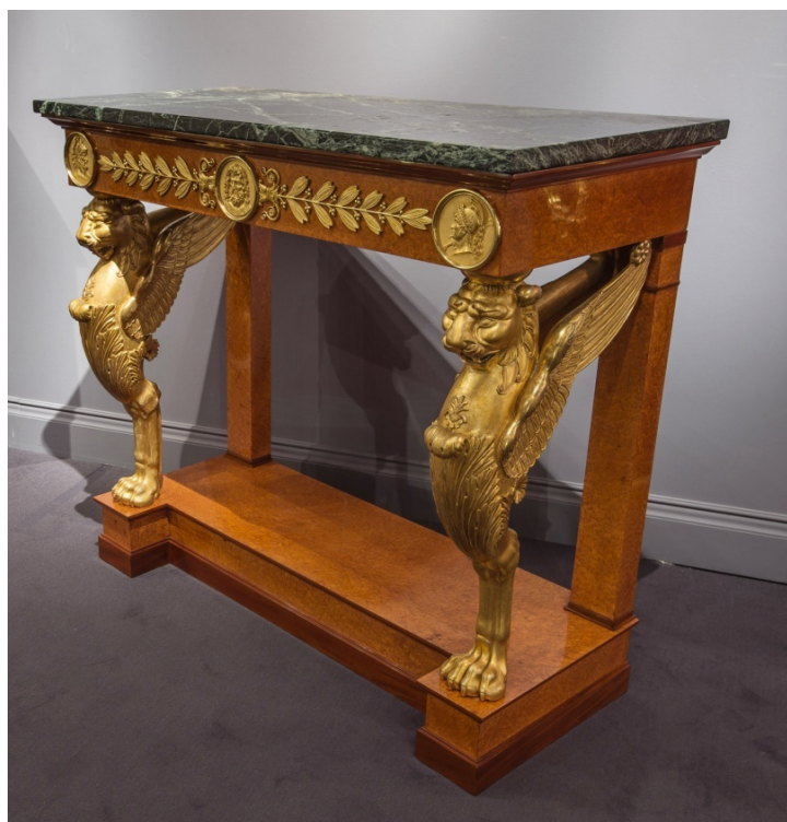
Fig. 3. A console table, Tuileries Palace, 1805. © Richard Redding Antiques Ltd.

Hector, one of the key persons of the Iliad and the leader of the Trojans and their allies in the defense of Troy, is also depicted in profile with long, wavy hair and sideburns wearing a typical Trojan helmet which is also decorated with a similar golden oak leaf wreath. He represents the mortal part of Emperor's personality which is however characterized by considerable moral values such as self-sacrifice, love for the fatherland, braveness and heroism. 14