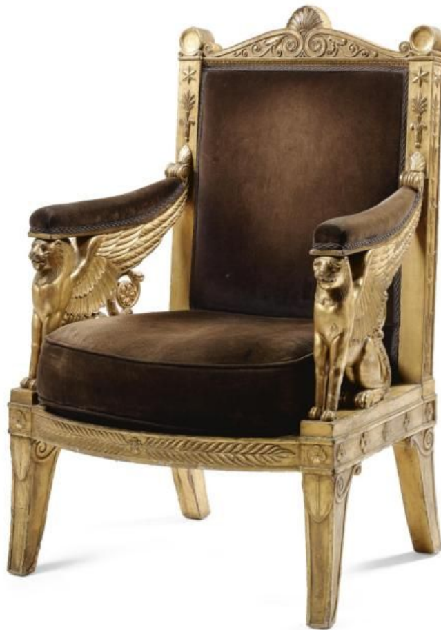
Fig. 2. One of the six Imperial carved giltwood ceremonial armchairs, Tuileries Palace, 1804.

Two years later, mainly for ceremonial reasons, the layout of the Hall of the throne was changed and this resulted in the remaining of only two of the six ceremonial armchairs, distinguished for their contemporary, innovative design, and of all thirty-six impressive folding stools. According to the protocol, only high rank courtiers had the right to sit on those stools or tabourets in general, whereas armchairs were mostly used by the Emperor, the Empress and members of the imperial family (MANSEL, 1987, p. 74).