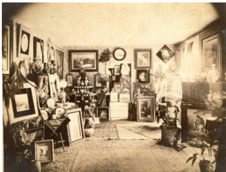
Fig. 3. Victorian middle-class domestic interior with a plethora of framed paintings and engravings as well as many decorative objects all over, 1840s.

The choice of colors for the interiors varied, depending on the location of the house (in the city center, in the suburbs or the countryside). The rationale for this variation was based on how the houses were exposed to environmental contamination, it being the main figment of the Industrial Revolution. For example, the houses in the city centers were not painted in pale tones for smog protection. Apart from painting the walls, the extensive use of wallpaper was a very common solution throughout the Victorian era. Especially in its first half, housewives sought fervently wallpaper whose background was most of the times in the colors of bright red, blue and green with rich floral repeating patterns, in usually large or moderate dimensions, in shades of cream and tan. The windows were usually covered with heavy curtains made of velvet or damask and often in imitation of such expensive fabrics, decorated with golden cords with tassels or fringes, while the walls were dominated, according to the aesthetic requirements of the ladies of the house, by large paintings or even prints depicting, usually, realistic subjects within heavy, gilded frames (Gloag, 1961: 99).