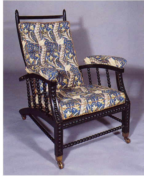
Fig. 6, 7. Two characteristic works by William Morris and Co: on the left (6) a leaf pattern wallpaper, 1865 and on the right & (7) reclining chair with handmade upholstery, 1866.

Correspondingly then, the same principles were perfectly aligned with the concept of female Victorian ethos as women had their own personal and family values which were based on the virtues of Christianity and love as well as on the principles of truth, honesty and chastity which should never be replaced by any other spurious or seemingly valuable morality. Besides honesty in production and the truth of materials advocated by this movement, it should be noted that Victorian female consumers had to face another important truth which however had to do with their national identity. The intention of the great personalities of the Arts and Crafts Movement to overcome their hideous ways and methods of mass industrialization by arguing that 'Life without Industry is guild, but Industry without art is brutality' (Naylor, 1990: 26) brought some more significant results. Without betraying the British tradition, Morris managed to combine the reviving of medieval patterns and craft techniques with designs taken from the exoticism of other countries and to create a new aesthetic style which, through numerous textiles, carpets, wallpapers, furniture and tiles designs, revealed the universality of the British empire. Victorian consumers had already begun then to perceive the seriousness of buying items for home, as their aesthetic and ideological attitude seemed to have been extremely improved.