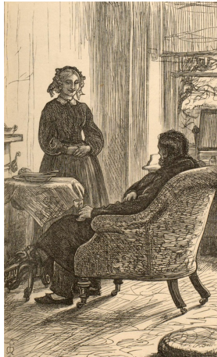
Fig. 1. Victorian engraving showing the woman's position at home, 1840s.

contracted with high female concepts such as caring, sentimentality and maternal protection, but also the unquestioned ethics.