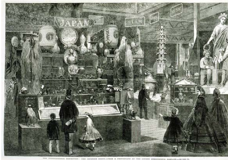
Fig. 5. The Great International Exhibition, London 1862: The Japanese Court.

The principles of simplicity, symmetry, geometricity and colors and textures economy were blended meticulously to the English tradition, creating new, innovative forms and values affecting not only the hitherto strong decorative nature of the objects, but also the functionality of the interiors themselves. Especially since the early years of the twentieth century space was simplified more, as it became more austere and functional, while maintaining the beauty and elegance of the Victorian ideal. The objects by which space was flanked were of unique beauty and harmony, while their functional character remained untouched and unchanged, which indicated the inclination of Victorian women in the adoption of a new consumer ethos.