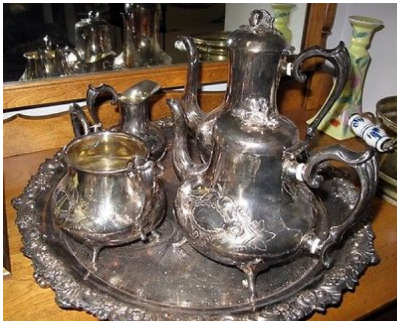
Fig. 4. An elegant Victorian Sheffield plate 5 piece tea and coffee set, 1845.

metal wares which bore the characteristic Neo-Rococo decoration of the real ones, in affordable prices though, implied not only good taste, luxury and prosperity, but also a step closer to the world of aristocracy.