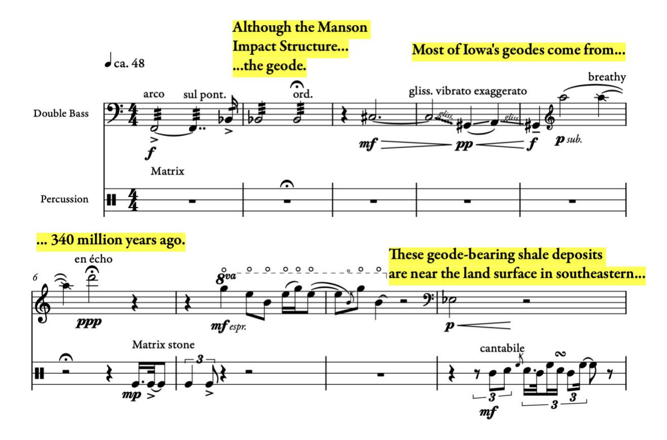
FIGURE 2 – Score excerpt.

This musical composition is scored for double bass and stone instruments. During the first part of the piece, two fermatas allow a geologist to tell the story of the Manson Impact Structure. He recounts how the study of shocked quartz grains from Manson cores showed that this crater was created by an asteroid about 74 million years ago. Meanwhile, a technician manipulates thin layers of rocks under a microscope; these images are fed to a live projection mapping system.