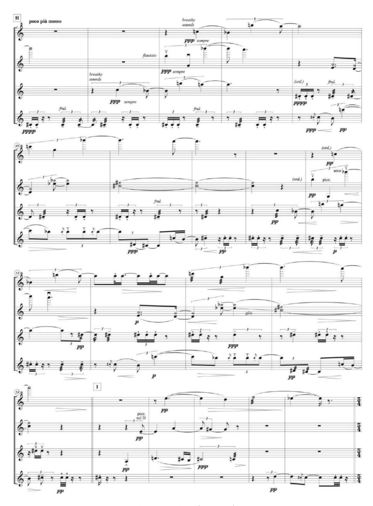
FIGURE 13 – Bars 44 to 63 from Teledescante n^{\varrho}I , including the short varied quotation from bars 42 and 43 of Verdelot's motet in rehearsal letter I.