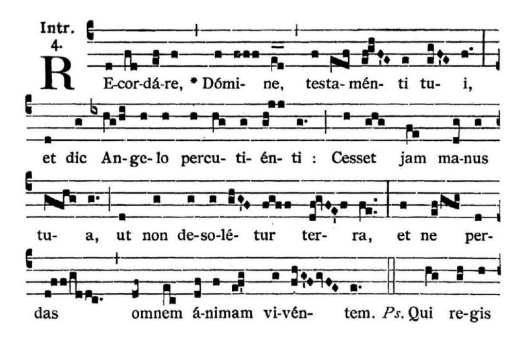
FIGURE 2 – Recordare domine, chant from the Pro vitanda mortalitate mass.

The musical materials in Verdelot's motet and their polyphonic structure reveal their origins both in Obrecht's 3-part Parce domine and in the chant for the Introitus of the Pro vitanda mortalitate mass (Fig.2). Verdelot's motet was written in the same mode as this Introitus , mode 4 (hypophrygian, in Glareanus's system).