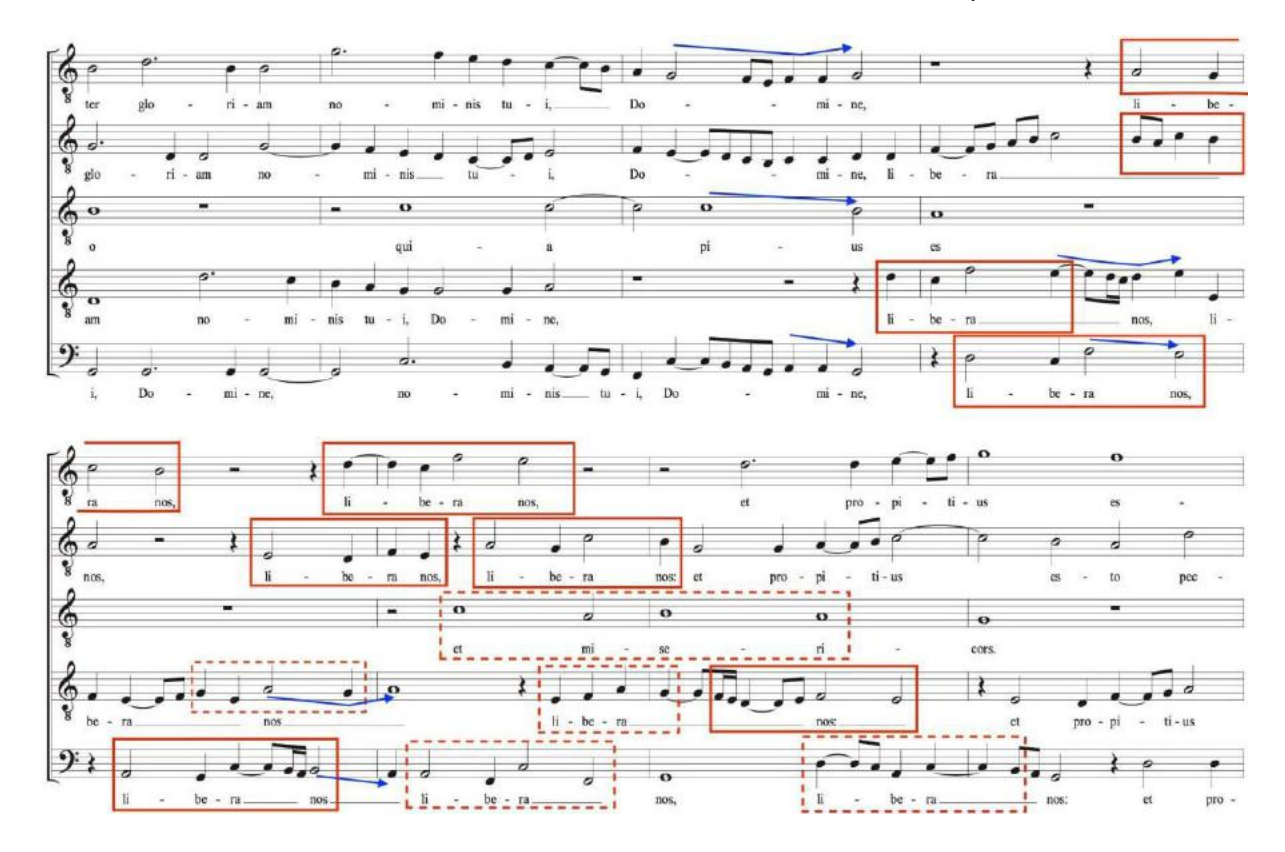
FIGURE 14 – Bars 38 to 45 from the motet Recordare domine / Adjuva nos by Verdelot, outlining the cadential movements and the occurrences of the "cross" motif (its variations are marked by dashed lines).

Source: VERDELOT (1532, transcribed by the author).