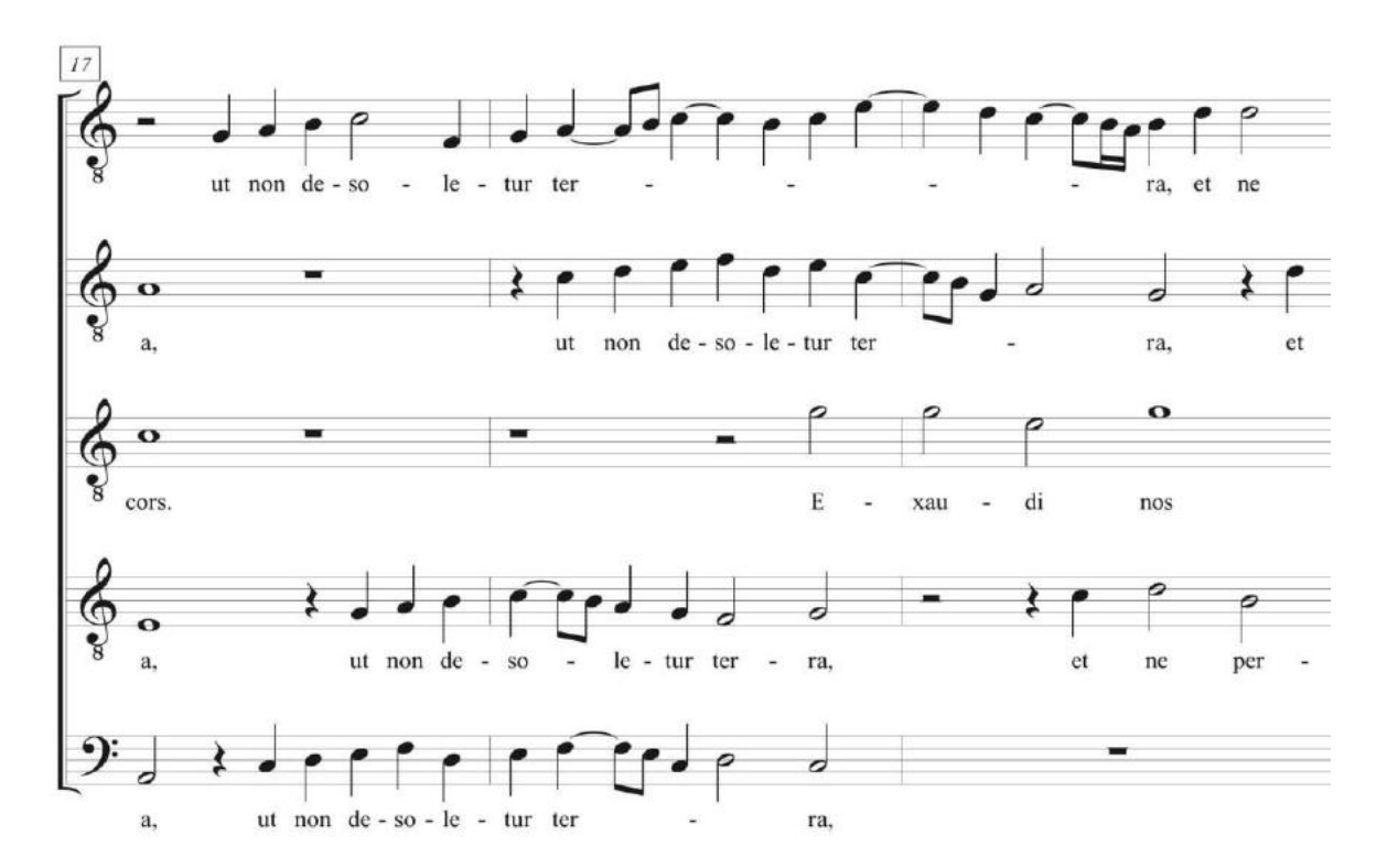
FIGURE 9 - Bars 17 to 19 from Recordare domine / Adjuva nos , by Verdelot.