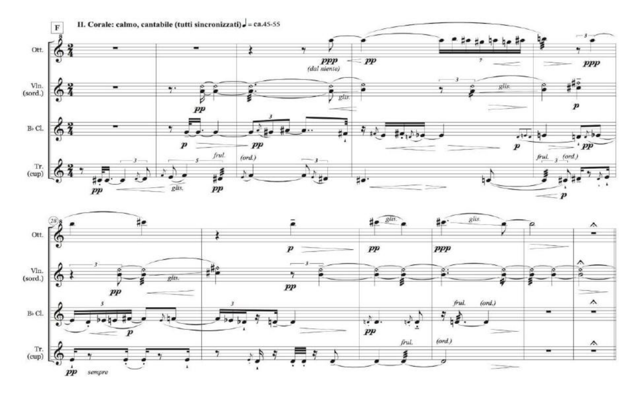
FIGURE 10 – Bars 23 to 33 from Teledescante nº1 .