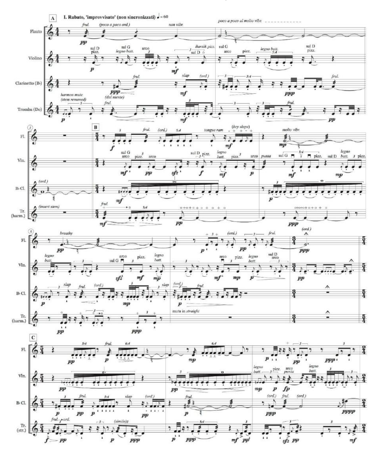
FIGURE 7 – Teledescante nº1, bars 1 to 11.