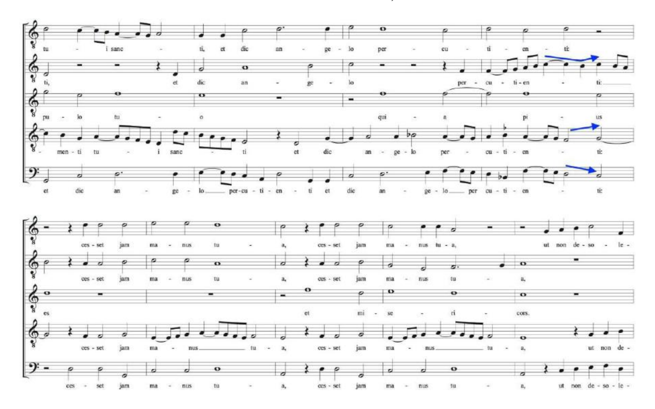
FIGURE 6 – Bars 9 to 17 from Recordare domine / Adjuva nos , with cadential movements on C pointed out, just before the enunciation of the text "cesset jam manus tua".