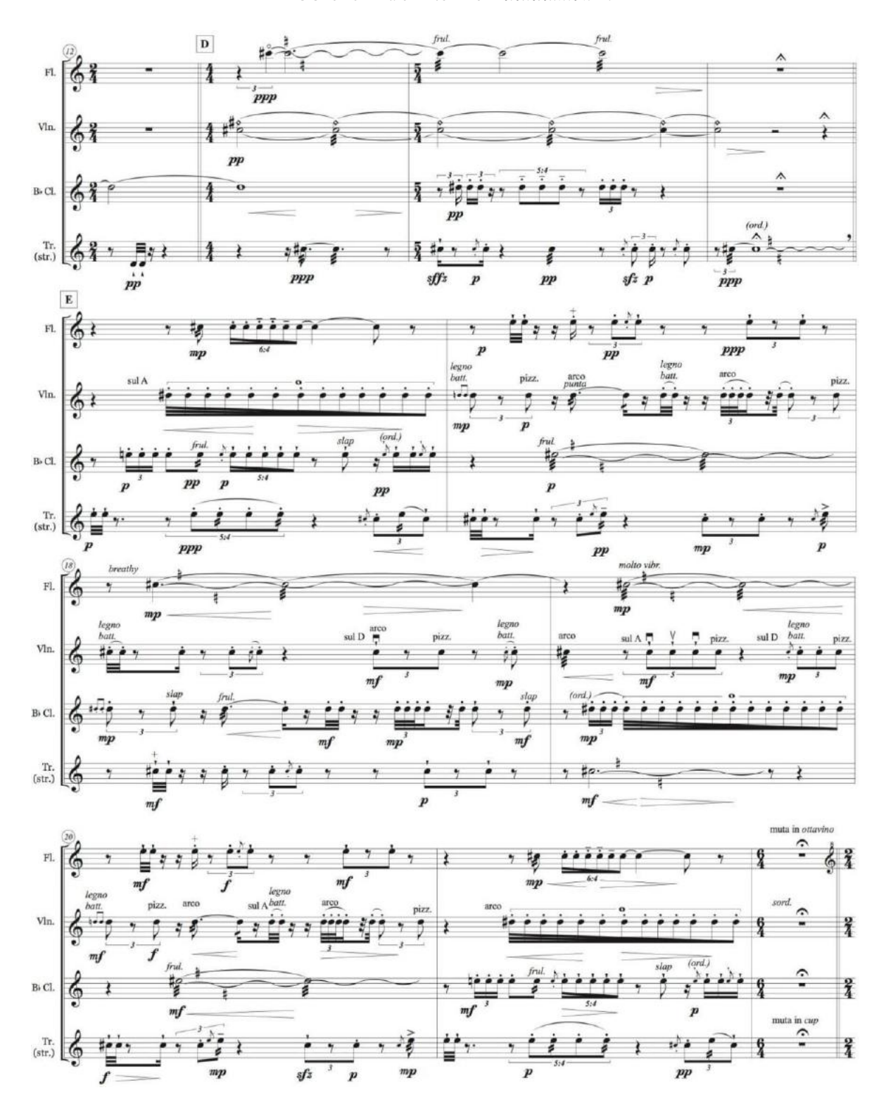
FIGURE 8 – Bars 12 to 22 of Teledescante nº1.