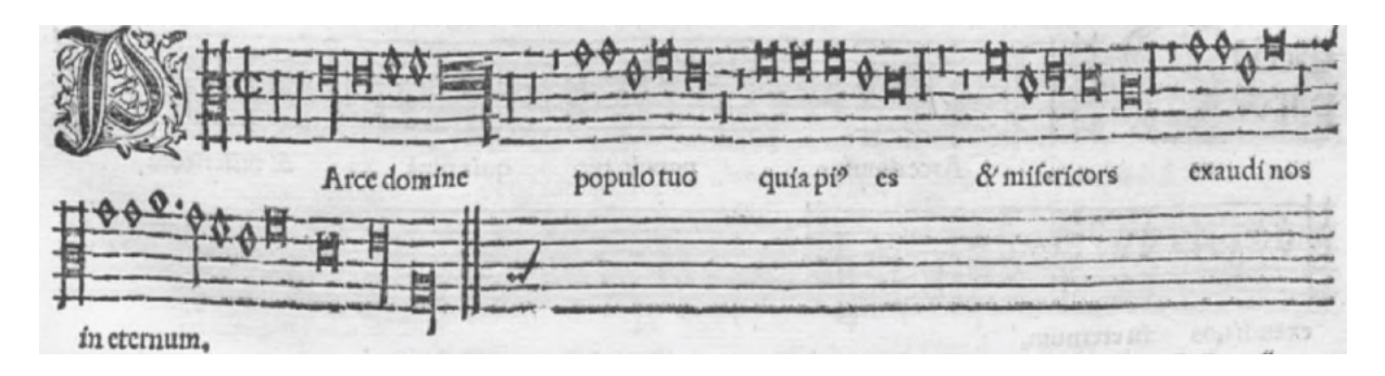
FIGURE 3 – Cantus firmus in the secundus altus in Recordare domine / Adjuva nos by Verdelot, originated in the bassus of Obrecht's 3-part Parce domine.

In turn, Obrecht's 3-part Parce domine has its final cadence over A, but the bassus in Obrecht's piece (Fig.3, which would serve as the cantus firmus for Verdelot's motet) emphasizes very prominently the note E in the first and last verses, before coming to a rest on A.