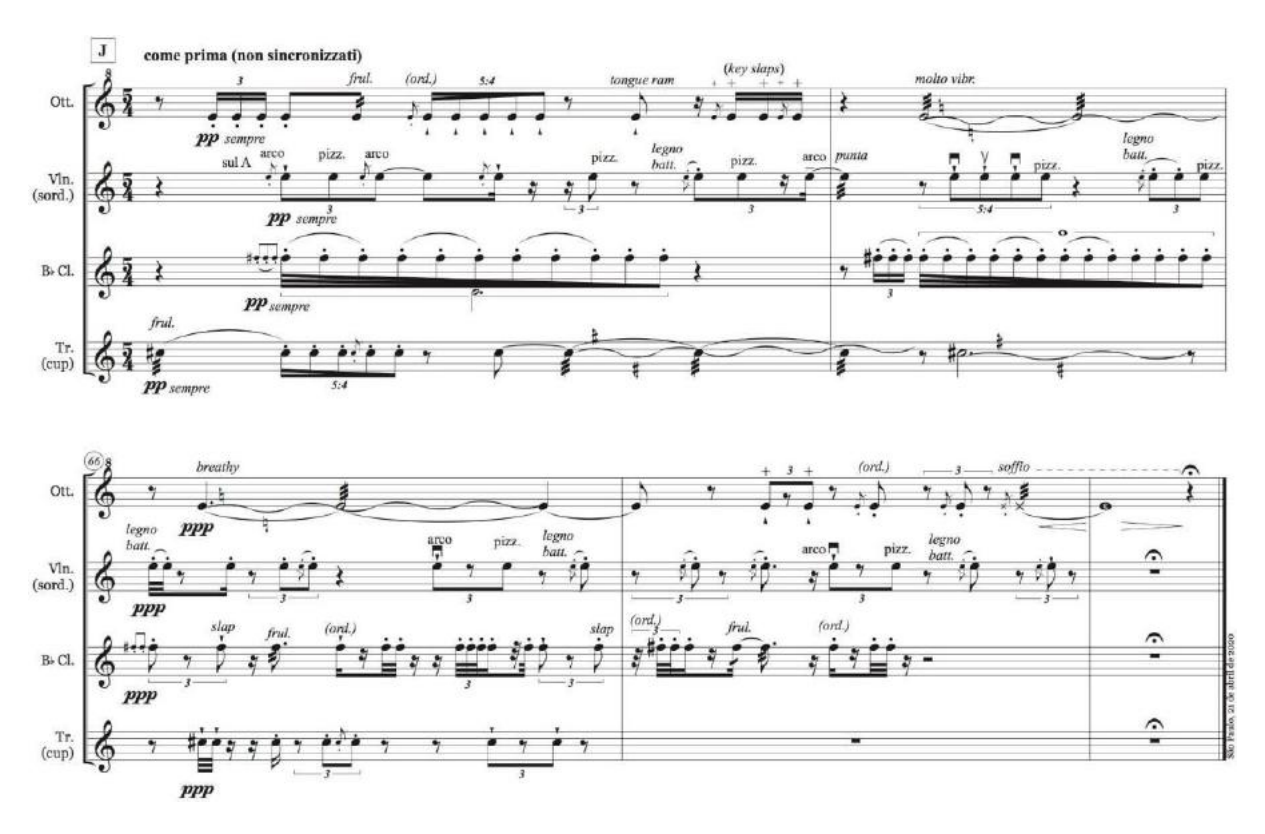
FIGURE 15 - Bars 64 to 68 of Teledescante nº1.

in the first part. This transposition not only accommodates the ensemble to the lower limit of the piccolo (enhancing its sonority contrast with the flute in the first part), but it also evokes the final cadences in Verdelot's motet, especially in the conclusion of the first part. The general tendency to come to a rest in the lower register is contradicted by Verdelot, who ends both parts of his motet in open positions, close to the upper limit of the overall register of the piece. Far from signifying a solemn closure, this opening in register, together with the absence of a complete cadential movement, contributes to suspension, to incompleteness, to a kind of circumstantial interruption of the polyphonic movement. In Teledescante nº1 the gradual dilution of accumulations leads to the last breath, in the low register of the piccolo: the most fragile instrumental register in the set, here it is already far from clear pitch definition and from varied oscillation criteria.