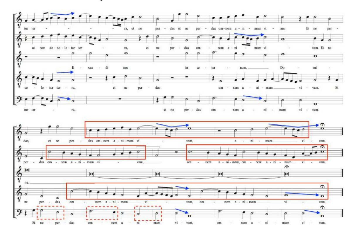
FIGURE 11 – Bars 18 to 27 from Recordare domine / Adjuva nos , by Verdelot, with markings on cadential movements and on the fragments that were referred to in bars 34 to 43 from Teledescante nº1 .

FIGURE 12 – Bars 34 to 43 from Teledescante nº1 .