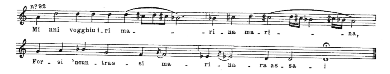
Figure 1: Corpus di Musiche Popolari Siciliane, Lyrical Song n. 92

Tiby mentions that it is common to find altered intervals in many Sicilian folk songs; they were added with the passing of ages and cultural influences or even modern innovations. He gives us the example of the augmented second, which was probably added by the influence of the Arab mode asbein , or Byzantine hymns of the II mode. This interval was incorporated and became a common melisma in the island songs, bringing with it a Mid-Eastern flavor (TIBY, 1957: 32).