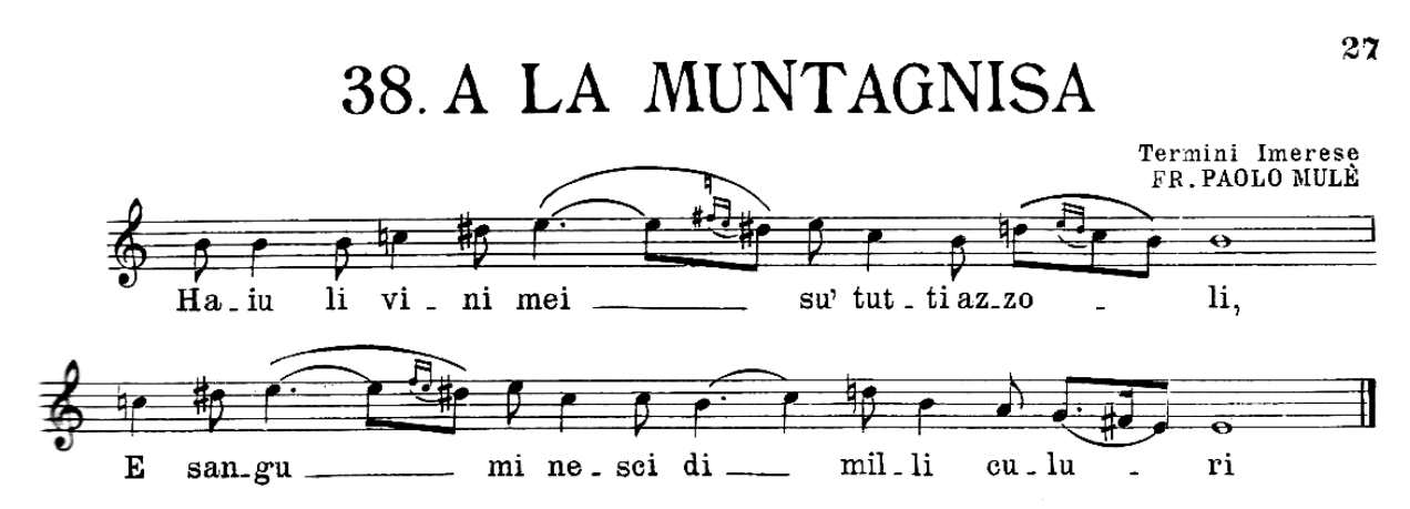
Figure 7: Corpus di Musiche Popolari Siciliane n. 38, A La Muntagnisa

The pitch center here is D, and it seems to be in Aeolian mode with some altered intervals (more specifically, raised 7th and lowered 9th). These intervals bring a Middle-eastern flavor to the melody, enhancing its expressivity. This is, in fact, another folk song, according to Bennici: "Here (pizzicato sequence before L), it is a simple thing, as well. It is another version of a simple song, also an abbagnata , of one that sells" (PIERMARTIRI, 2013: 104). This unknown abbagnata was not found among those present in Corpus , although it is possible to find several lyrical songs that are built with the same intervals and have similar phrase shape. The song that resembles it the most is A la Muntagnisa , Corpus n. 38. The key is in E, one step above from the melody in Naturale .