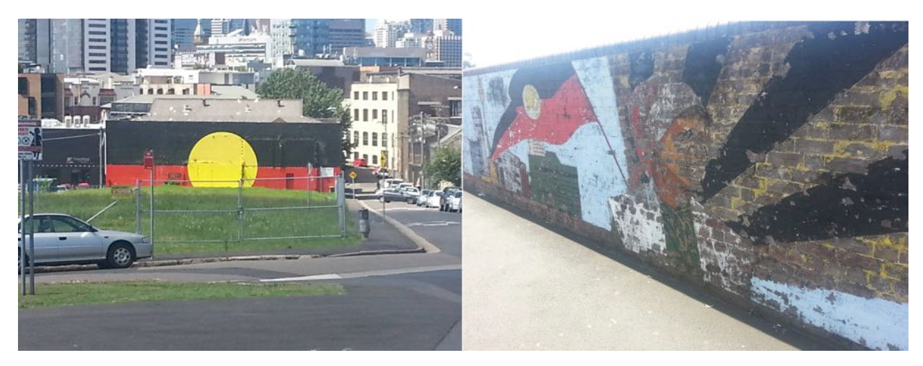
Figure 1 – The Aboriginal flags on Redfern's walls and fences.

On 26 January 2016 I did not want to participate to the celebration of the persisting invasion of the land where I was temporarily residing, and hence decided to participate to an Aboriginal and Torres Strait Islanders counter-event in Sydney, called Yabun Festival. To reach the festival, I travelled to Redfern Station to then walk to the Venue; on leaving the station, I was able to admire the Aboriginal flag painted on every wall (Fig. 1).