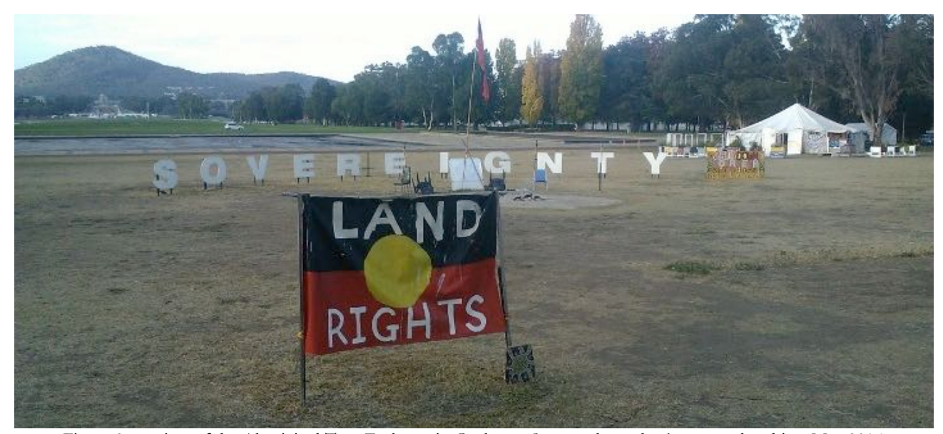
Figure 2 – a view of the Aboriginal Tent Embassy in Canberra.

One of the last chapters of my stay in Australia involved a trip to Canberra, where I visited the Aboriginal Tent Embassy (Fig. 2) that stands in front of the Old Parliament. The Tent Embassy in Canberra is yet another testimony of an unextinguished indigenous sovereignty, to which my piece is, ultimately, a passionate homage.