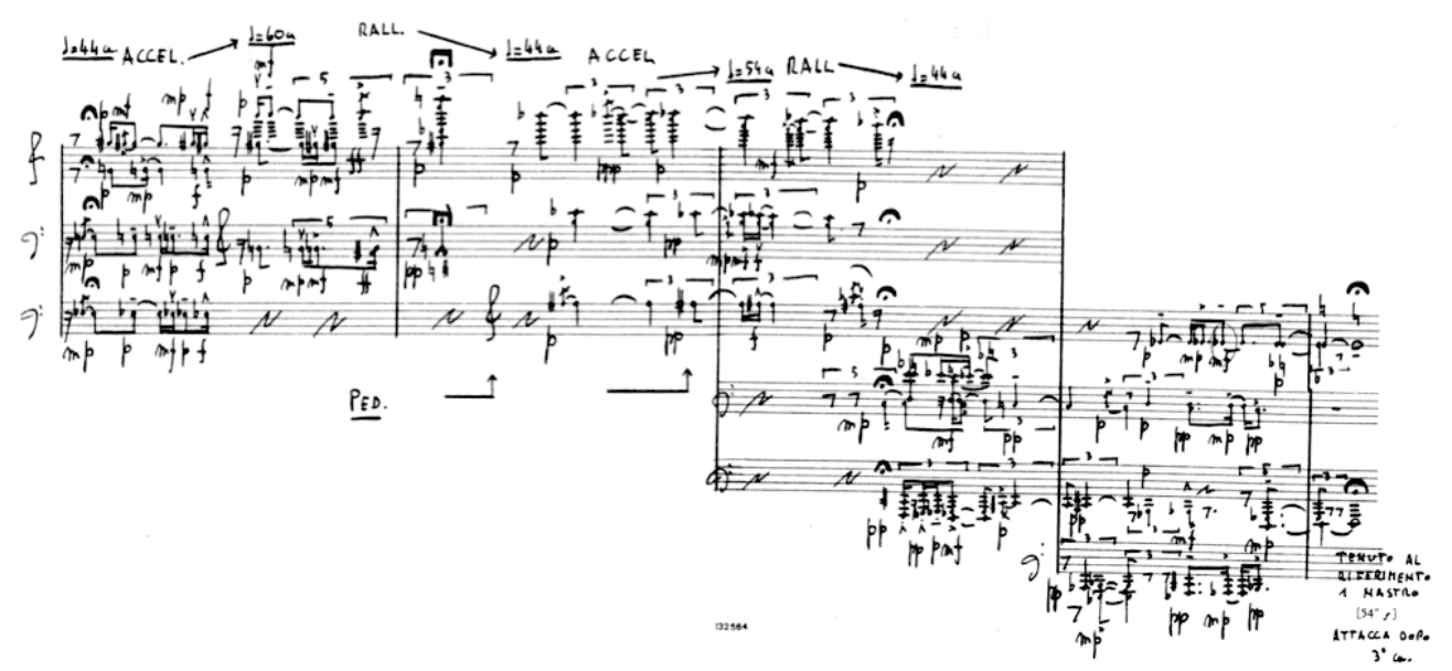
Ex. 1 – Constant changes in tempo and several fermatas, at the second system page 6 of ... sofferte onde serene...

fermatas, of different lengths (see Ex. 1). The result is a very fluid performance, like a written rubato . But this only happens properly if the pianist knows the tape part very well. That is the key point of learning ....sofferte onde serene..., the pianist has to be totally familiar with the tape. One would argue that this is true for any instrumental piece with tape, a statement I would agree with. But in this case, the decisions prior to, and during, performance depend 100% upon this familiarity. There is no stopwatch or click track. We need to listen. And listening, according to Nono, is "very difficult. I think it is a rare phenomenon today. (...) Perhaps one can change the rituals: perhaps it is possible to try to wake up the ear. To wake up the ear, the eye, human thinking, intelligence, the most exposed inwardness. This is now what is crucial" (NONO, in ASSIS, 2014: 205).