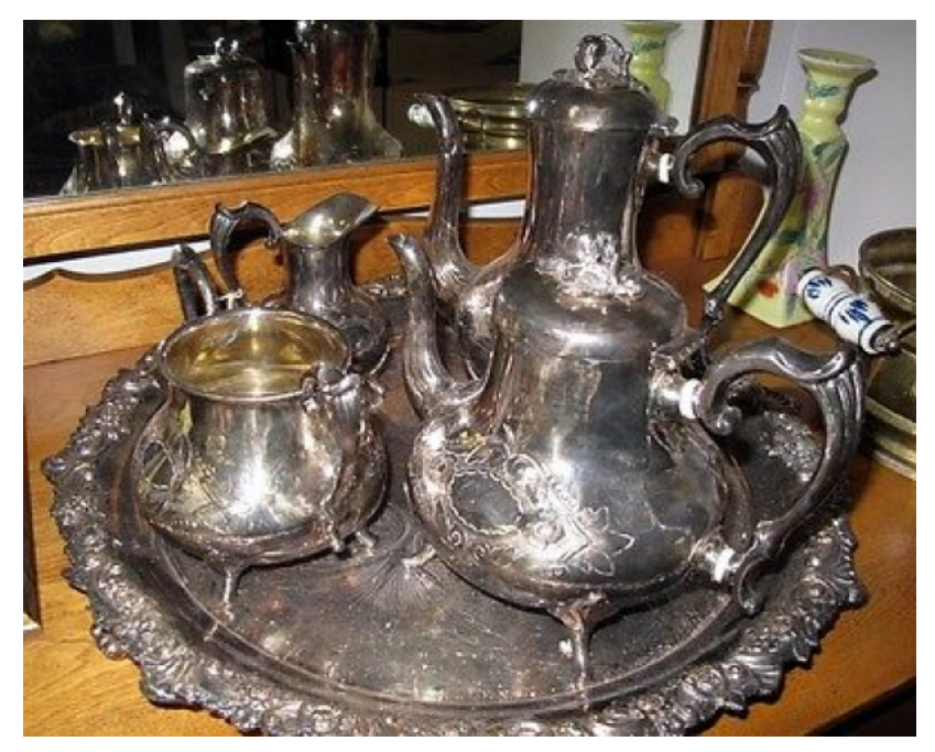
Fig. 4. An elegant Victorian Sheffield plate 5 piece tea and coffee set, 1845.

metal wares which bore the characteristic Neo-Rococo decoration of the real ones, in affordable prices though, implied not only good taste, luxury and prosperity, but also a step closer to the world of aristocracy.