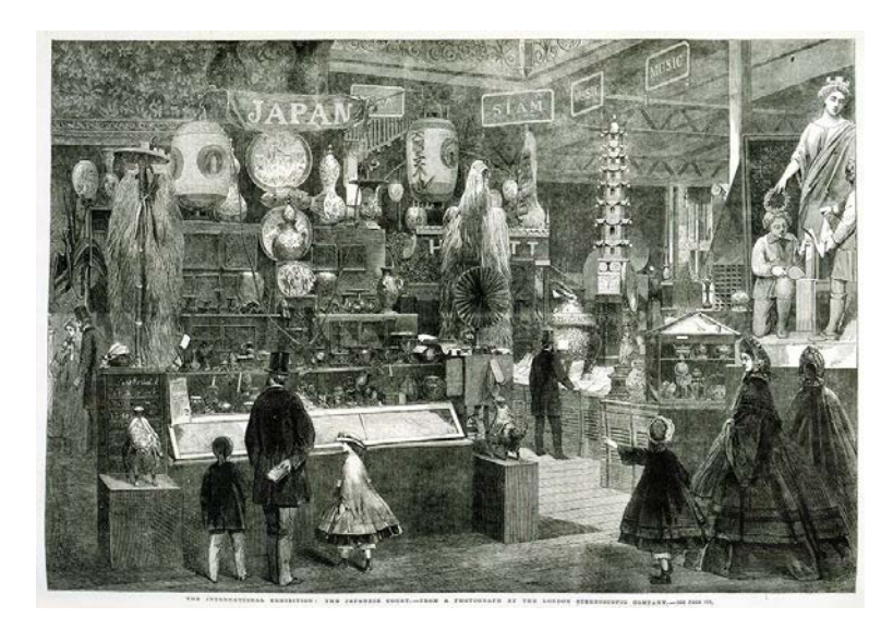
Fig. 5. The Great International Exhibition, London 1862: The Japanese Court.

The principles of simplicity, symmetry, geometricity and colors and textures economy were blended meticulously to the English tradition, creating new, innovative forms and values affecting not only the hitherto strong decorative nature of the objects, but also the functionality of the interiors themselves. Especially since the early years of the twentieth century space was simplified more, as it became more austere and functional, while maintaining the beauty and elegance of the Victorian ideal. The objects by which space was flanked were of unique beauty and harmony, while their functional character remained untouched and unchanged, which indicated the inclination of Victorian women in the adoption of a new consumer ethos.