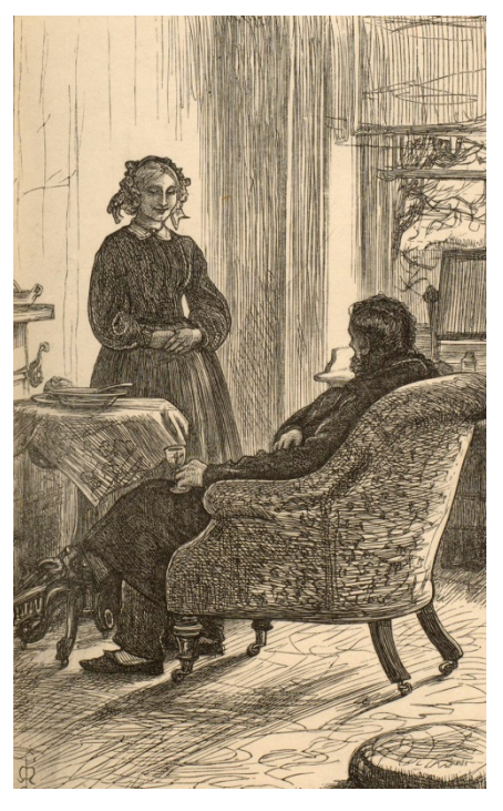
Fig. 1. Victorian engraving showing the woman's position at home, 1840s.

contracted with high female concepts such as caring, sentimentality and maternal protection, but also the unquestioned ethics.