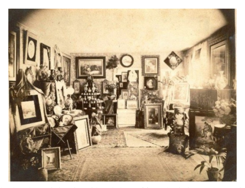
Fig. 3. Victorian middle-class domestic interior with a plethora of framed paintings and engravings as well as many decorative objects all over, 1840s.

The choice of colors for the interiors varied, depending on the location of the house (in the city center, in the suburbs or the countryside). The rationale for this variation was based on how the houses were exposed to environmental contamination, it being the main figment of the Industrial Revolution. For example, the houses in the city centers were not painted in pale tones for smog protection. Apart from painting the walls, the extensive use of wallpaper was a very common solution throughout the Victorian era. Especially in its first half, housewives sought fervently wallpaper whose background was most of the times in the colors of bright red, blue and green with rich floral repeating patterns, in usually large or moderate dimensions, in shades of cream and tan. The windows were usually covered with heavy curtains made of velvet or damask and often in imitation of such expensive fabrics, decorated with golden cords with tassels or fringes, while the walls were dominated, according to the aesthetic requirements of the ladies of the house, by large paintings or even prints depicting, usually, realistic subjects within heavy, gilded frames (Gloag, 1961: 99).