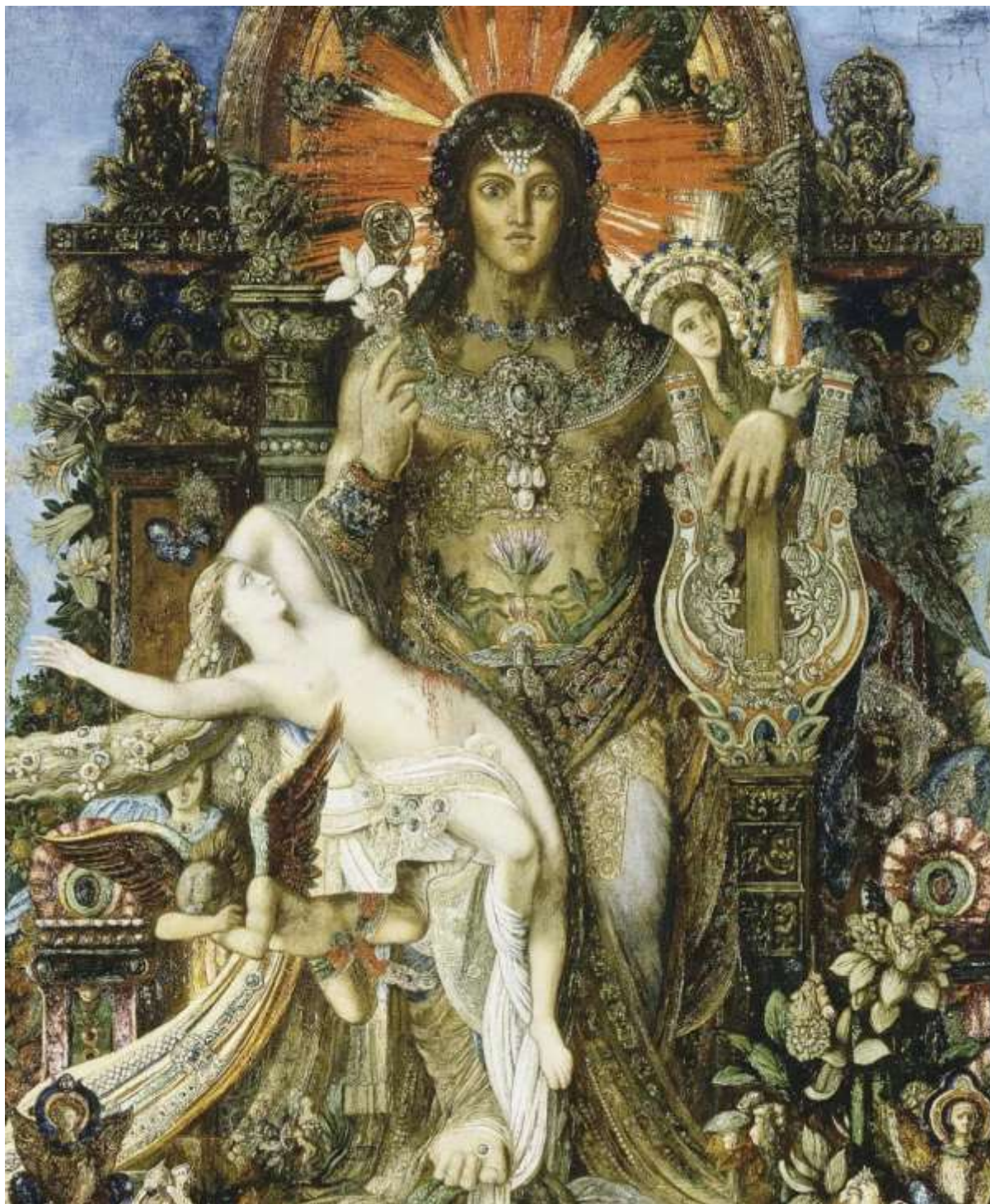
Gustave Moreau, Jupiter and Semele (detail), 1895. Oil on canvas, 212 x 118 cm, Musée Gustave Moreau, Paris.