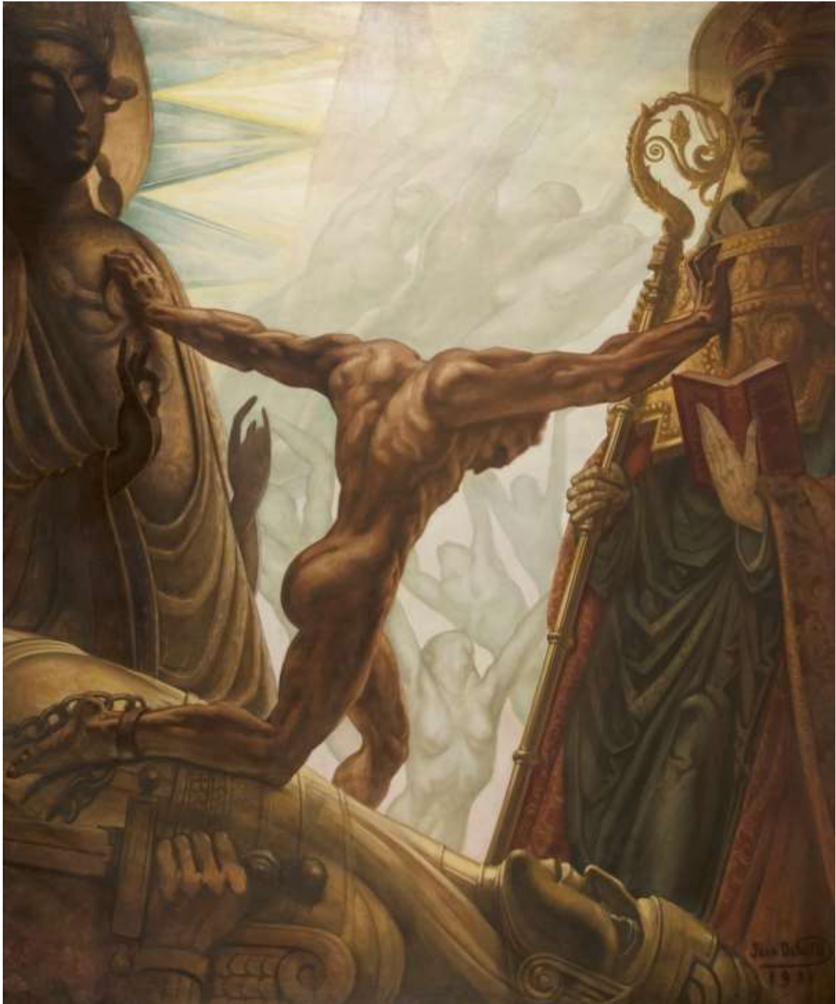
Jean Delville, The Last Idols , 1931. Oil on canvas. 300x450 cm

We could say, therefore, that part of the powerfully engaging quality of art, for instance listening to Spring by Vivaldi, reading Lord of the Rings , or absorbing ourselves in a painterly work of magnitude, is to enter a transpersonal space of a highly charged ‘rhizome’ of memetic referents that will, as it were, ‘vibrate’ or ring or chime