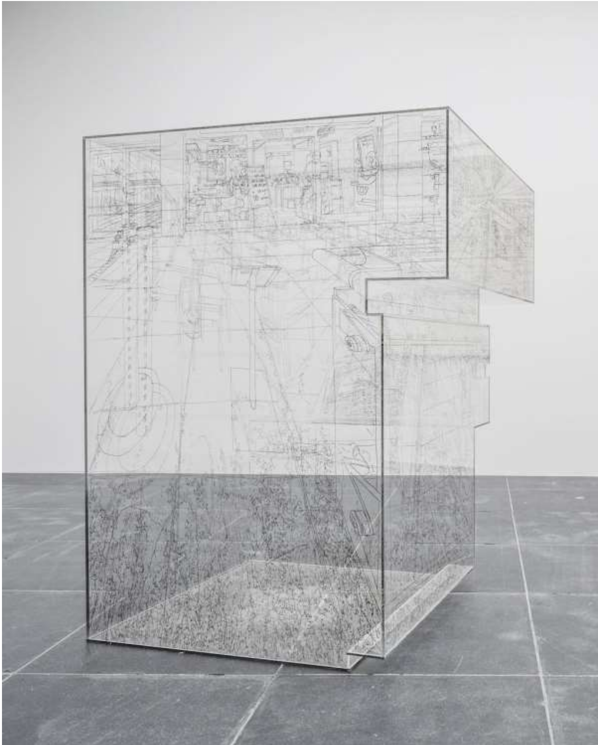
Pia Linz, Box Engravings, 2004. Gallery of Contemporary Art - House of Art of České Budějovice

If the meme/idea is weak, it will be subsumed by other more dominant memes. It may mate or recombine with other ideas producing hybrids in a kind of dialectic process of thesis-antithesis-synthesis. Through day-to-day conversation, versions of reality are spoken to one-another and so compared, dismissed or