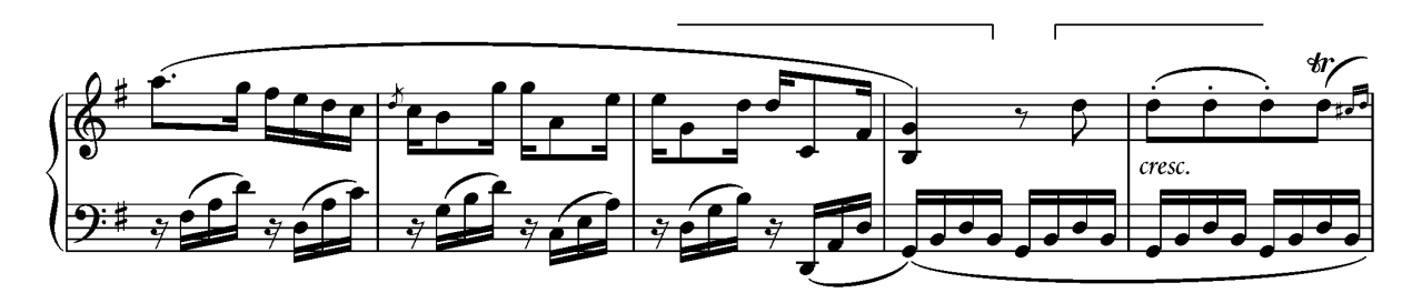
Fig. 3 – Ludwig van Beethoven. Piano Sonata , Op. 14, No. 2, 1st mvt., ms. 5-9. Adapted from MESQUITA, Marcos. Segmentation and Juxtaposition: A brief critical survey. Percepta , v. 3 (2), p. 69-80, 2016.

The excerpt below is brought by Mesquita (2016) as an example of juxtaposition, defined by the author as the most characteristic strategy of sound projection in time of Western tonal music. In the eighth measure of this Sonata, Beethoven "begins a new accompaniment in the left hand [and thus] anticipates the accompaniment of the transition, which starts in measure nine, and confounds momentaneously the listener" (MESQUITA, 2016: 77):